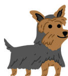
Yorkshire Terrier Yorkshire terrier