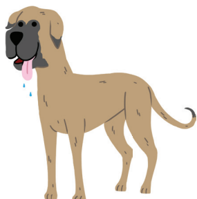
Great Dane Deense dog