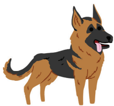
German Shepherd Duitse herder